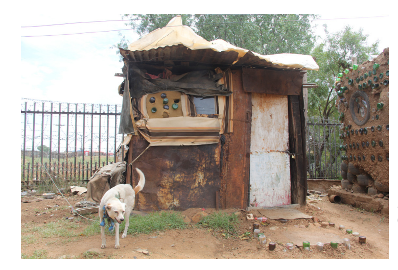
Typical township living conditions, 2017